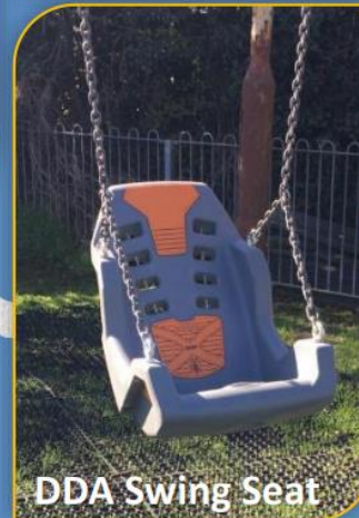
DDA Swing Seat