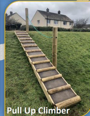
Pull Up Climber