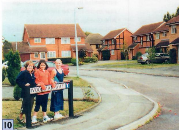
10 16/09/2000 16:00 JS