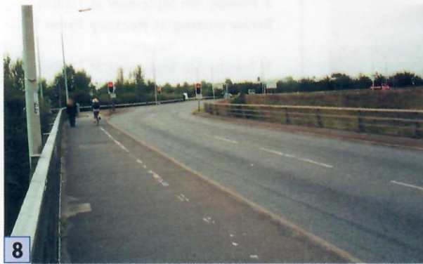
8 14/09/2000 08:30 SMB