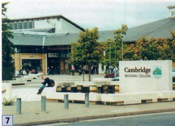
7 13/09/2000 15:00 SMB