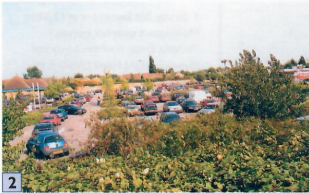
2 11/09/2000 13:00 SMB