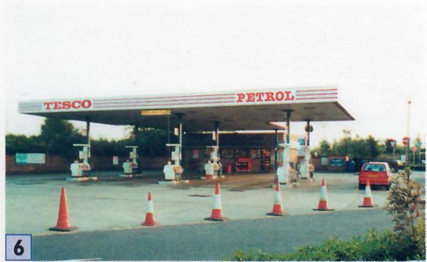
6 12/09/2000 18:00 SMB