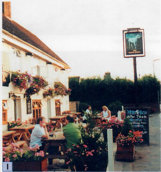
1 10/09/2000 19:15 HMS