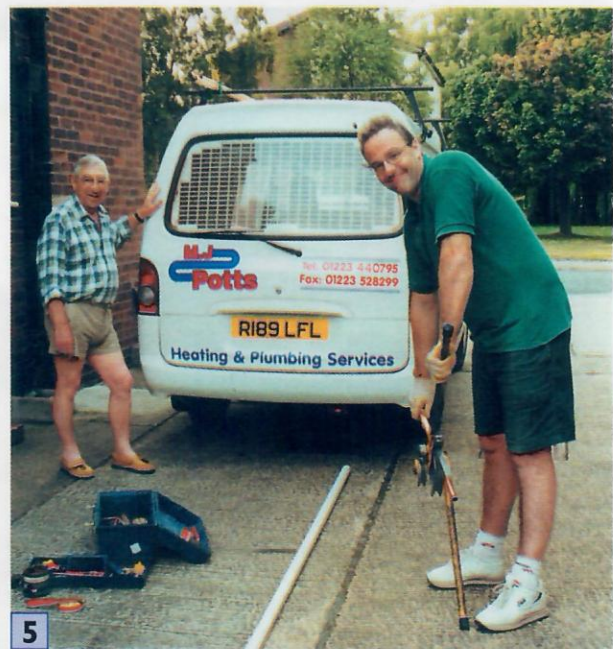
5 11/09/2000 18:15 JEC