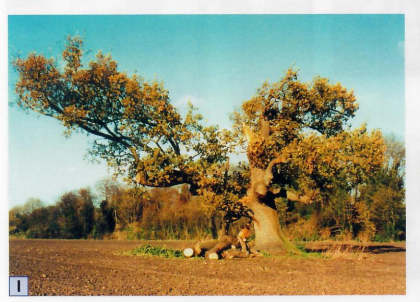
26/11/2000 13:00 ARH