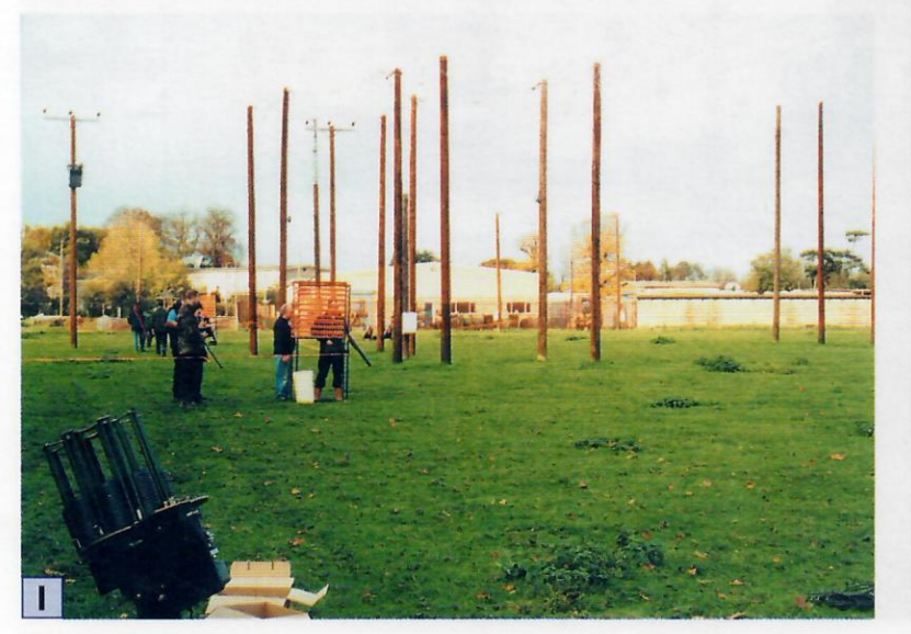
05/11/2000 11:00 HMS