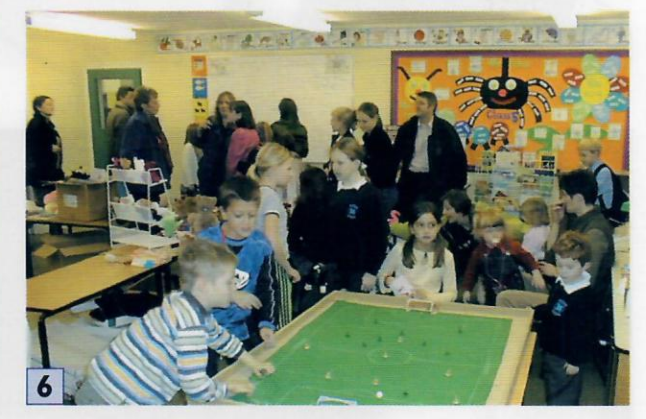
30/11/2000 18:00 JS