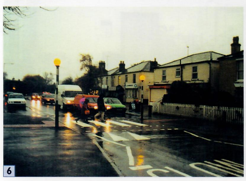
23/11/2000 15:30 ARH