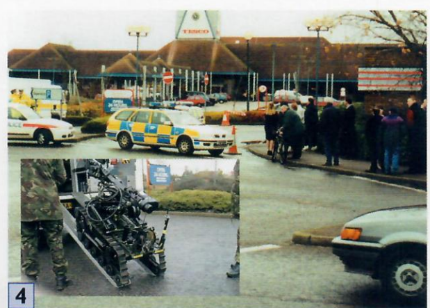
28/11/2000 11:00 JD