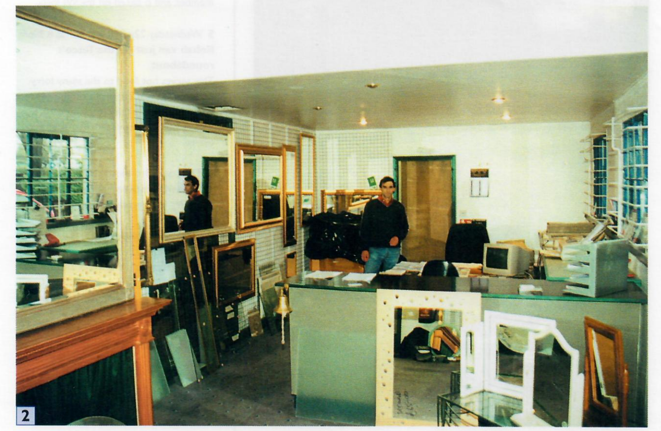
27/11/2000 14:00 SMB