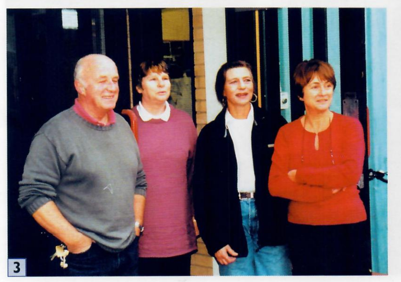
28/11/2000 09:10 JD