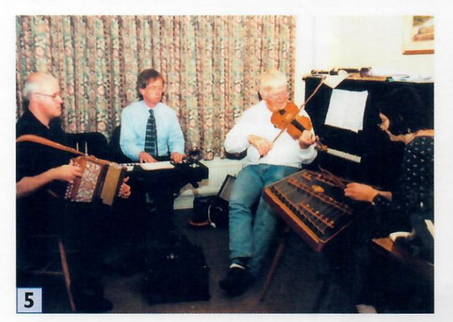
29/11/2000 20:15 JEC