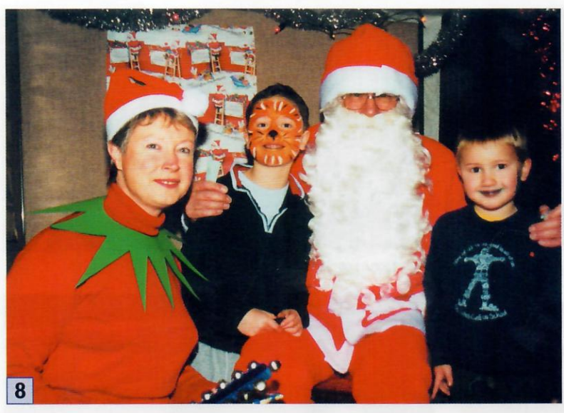
02/12/2000 14:00 ARH