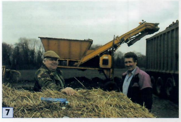
01/12/2000 11:30 HMS