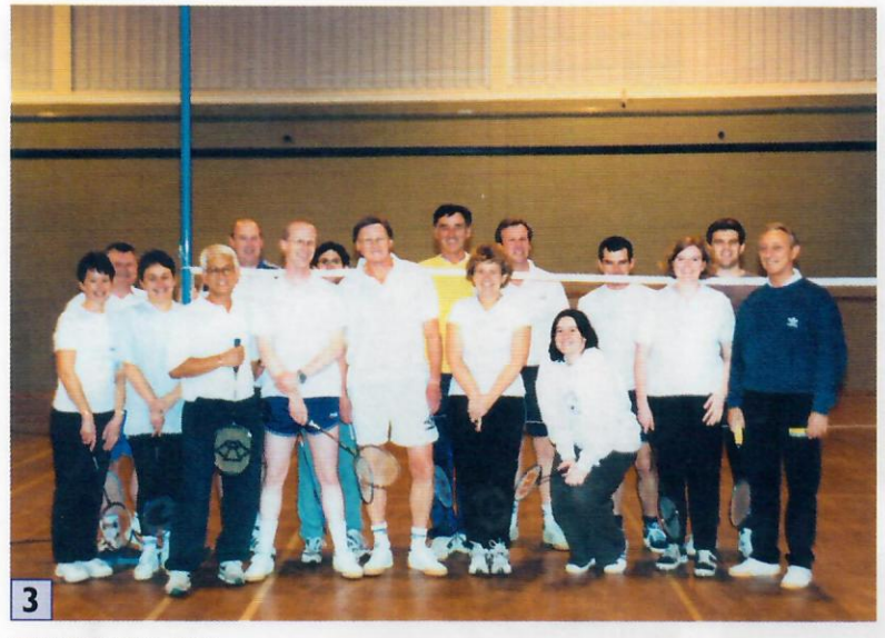
07/11/2000 20:15 HMS