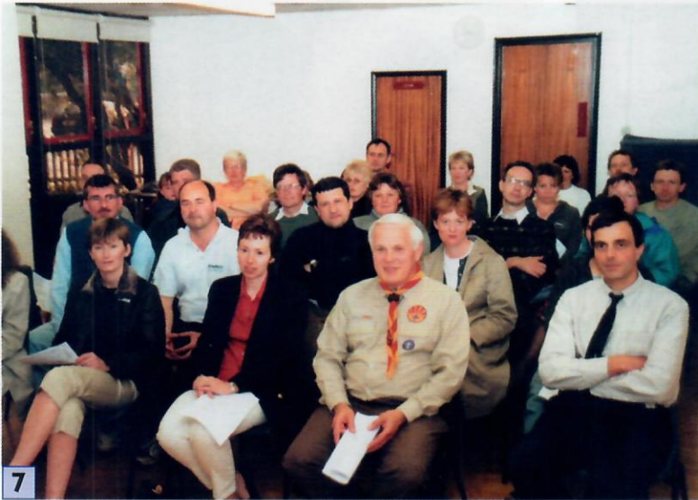
19/05/2000 20:00 PSB