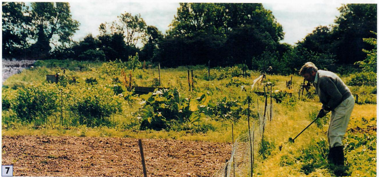
26/05/2000 11:00 ARH