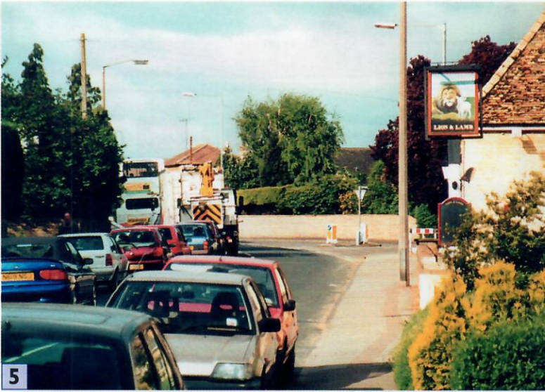
17/05/2000 08:30 SMB