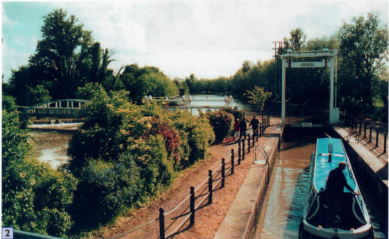
02/06/2000 19:45 JLC