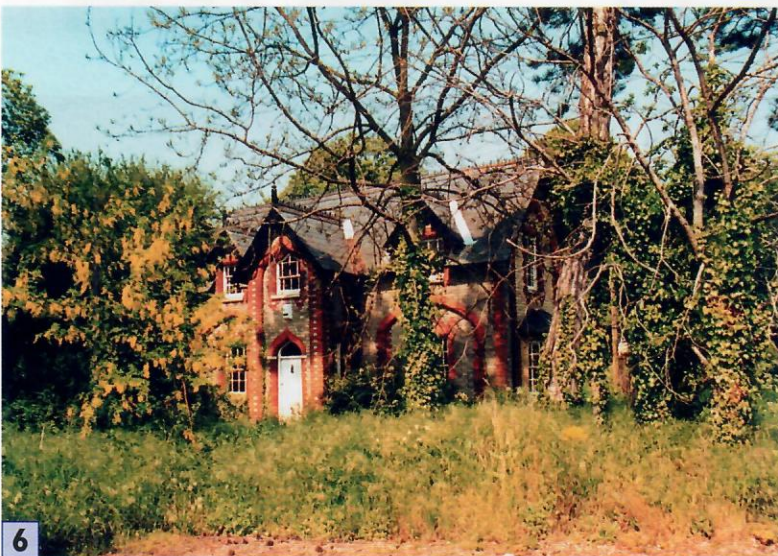
6 05/05/2000 15:00 JS