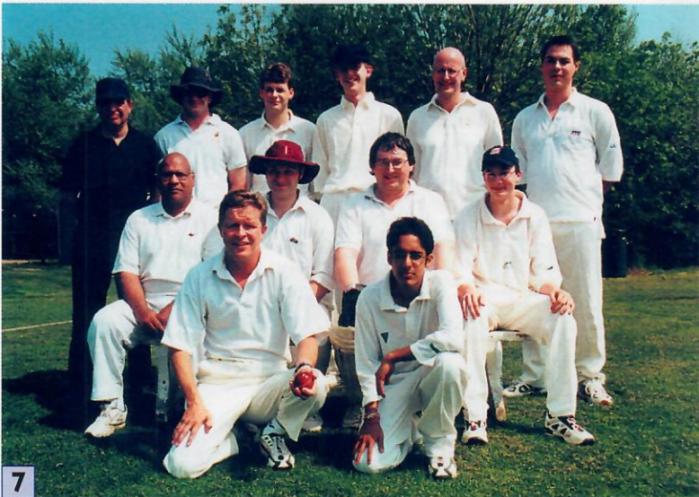
7 06/05/2000 JEC