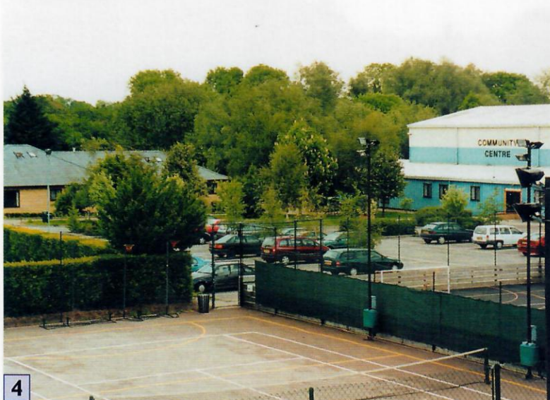
24/05/2000 10:30 JD