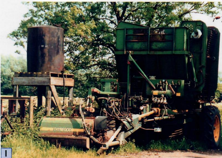
14/05/2000 15:00 MJS