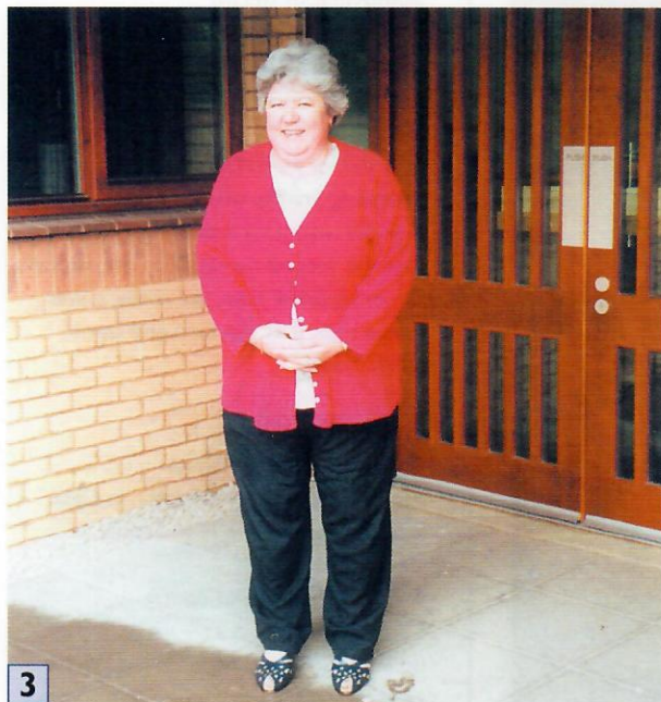
25/05/2000 12:00 JD