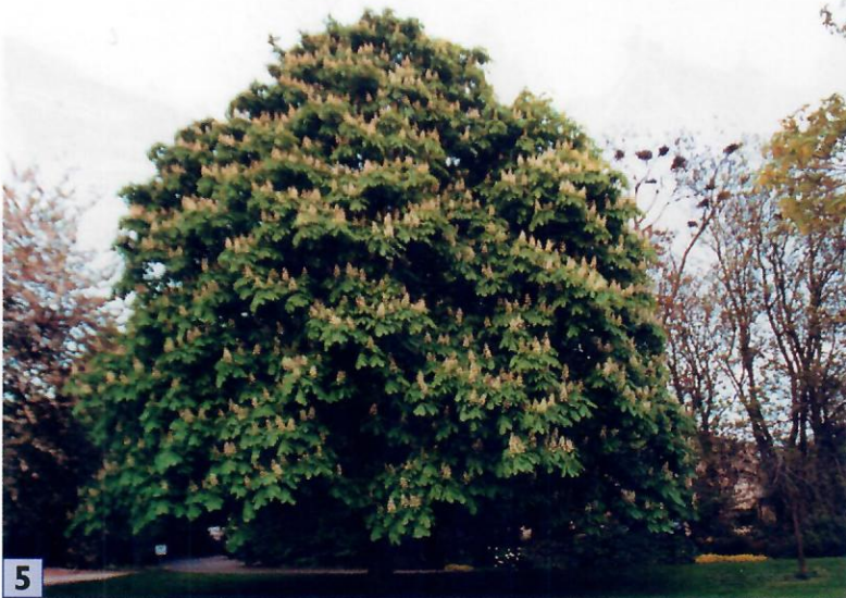
5 04/05/2000 19:00 JS