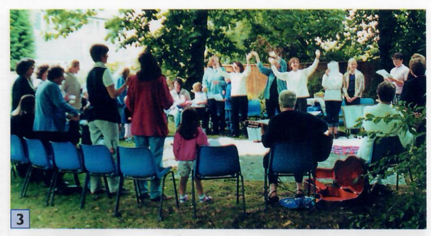
27/07/2000 09:00 SMB