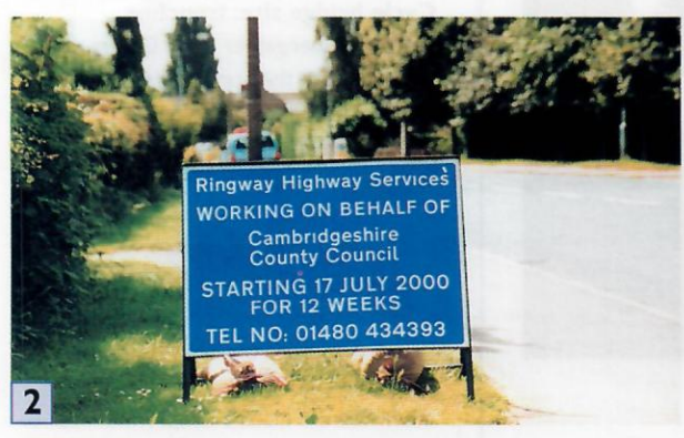
17/07/2000 12:15 JD