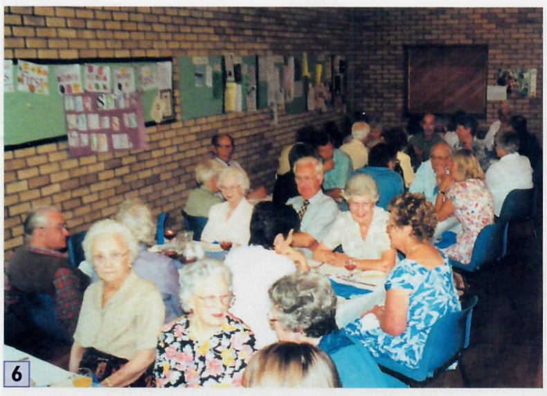
20/07/2000 12:30 JD