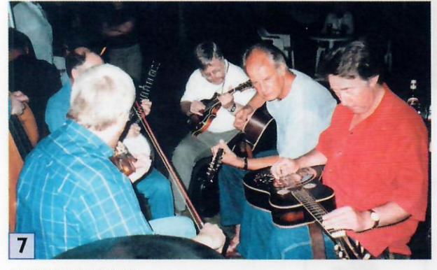
20/07/2000 22:30 HMS