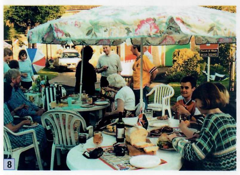
29/07/2000 19:00 ARH