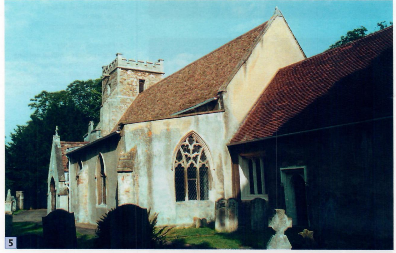
27/07/2000 09:00 SMB