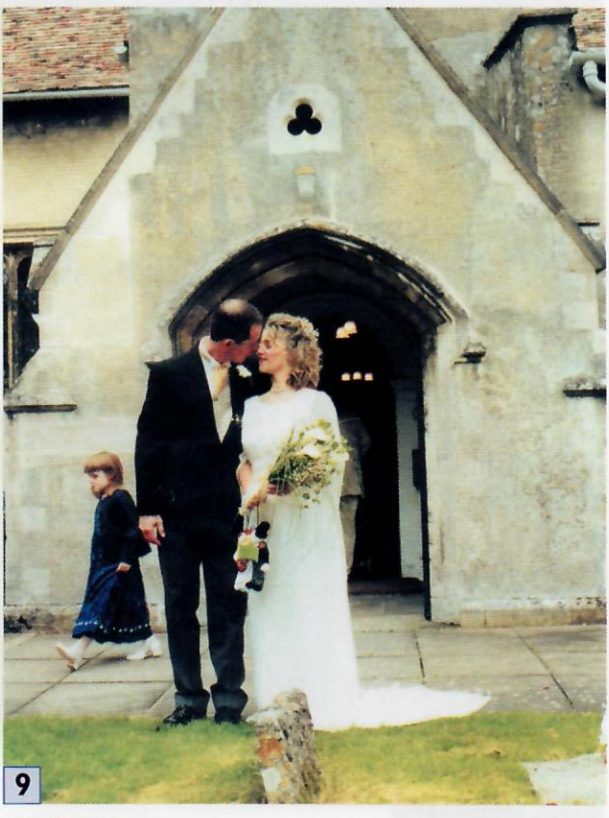
22/07/2000 16:00 JS