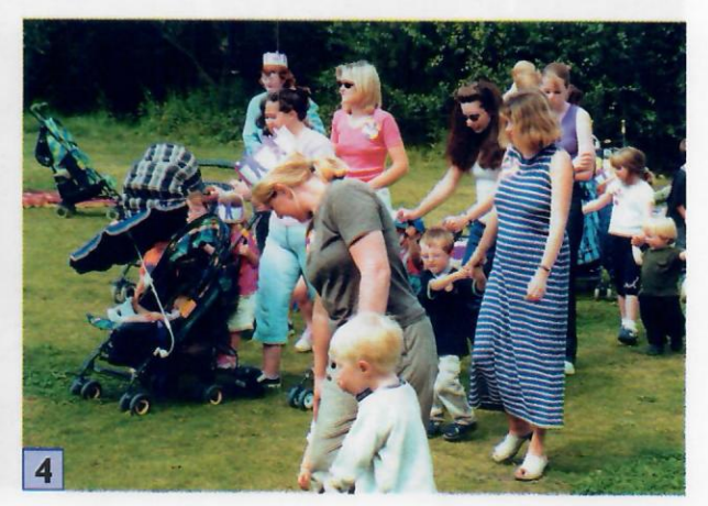
26/07/2000 11:30 JD