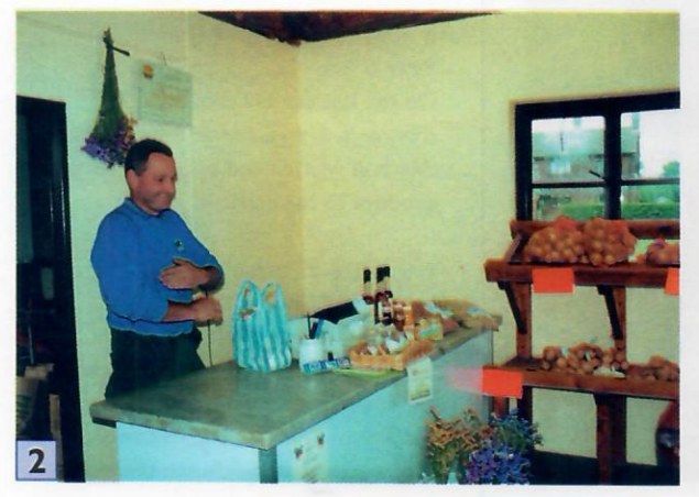
24/07/2000 11:15 JS