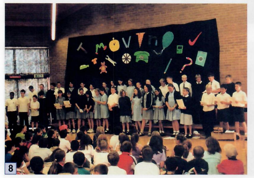
21/07/2000 09:30 JS