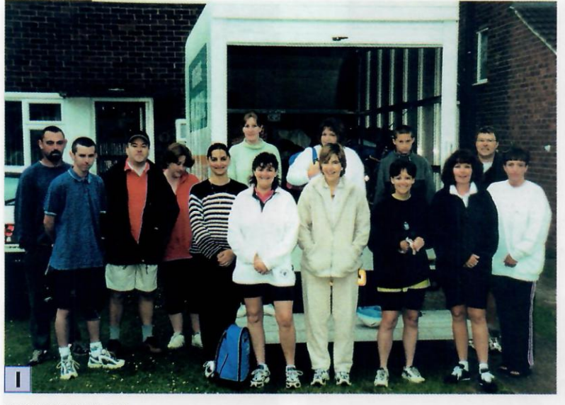
23/07/2000 06:45 PSB