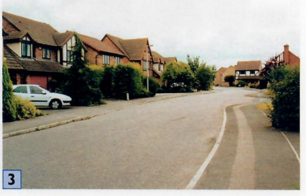
11/07/2000 14:00 HMS