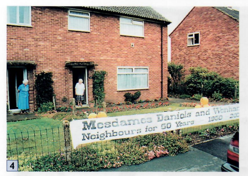
05/07/2000 13:00 JD