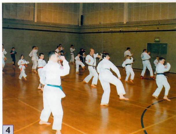
02/02/2000 20:00 JS PSB