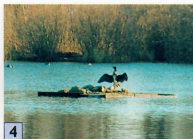
26/01/2000 14:00 HMS