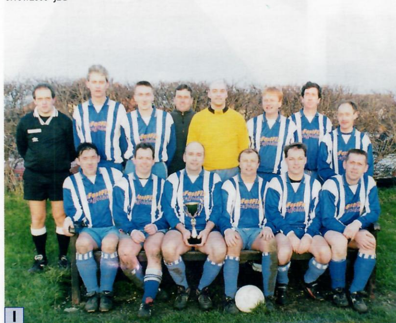
02/01/2000 15:30 JEC