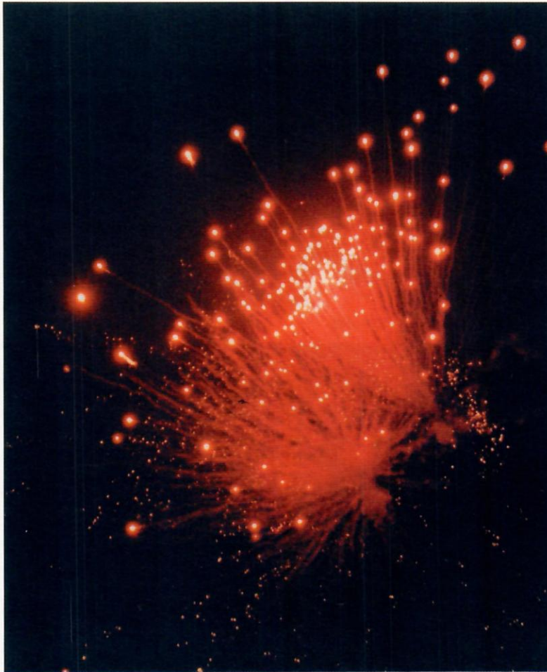
01/01/2000 00:01 JD