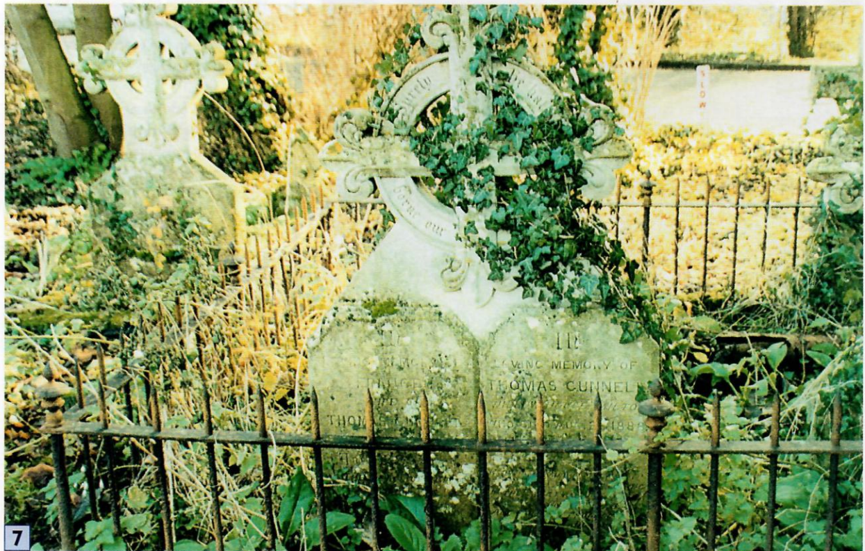
15/01/2000 10:30 MJS