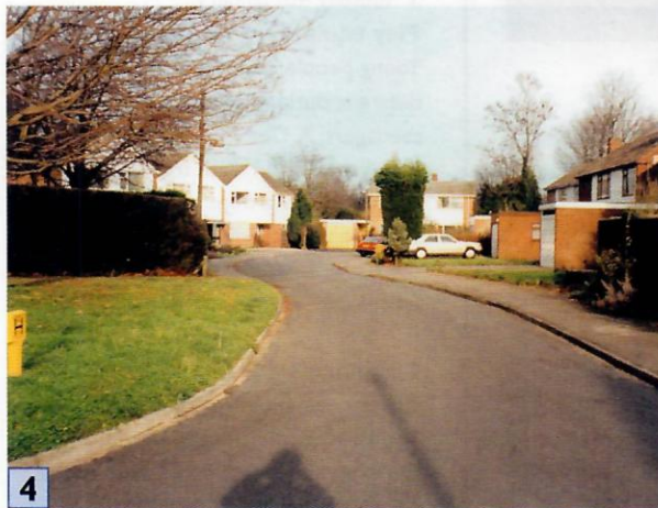
12/01/2000 12:00 MJS