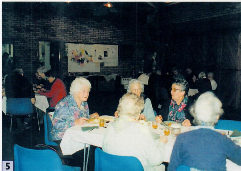
20/01/2000 13:00 REH