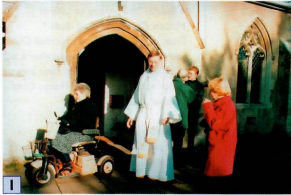
09/01/2000 11:45 JEC