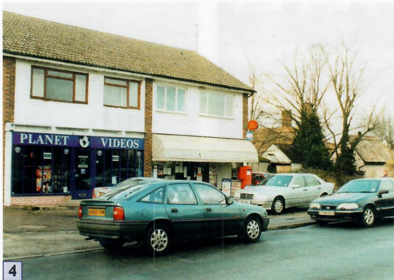
19/01/2000 14:30 ARH