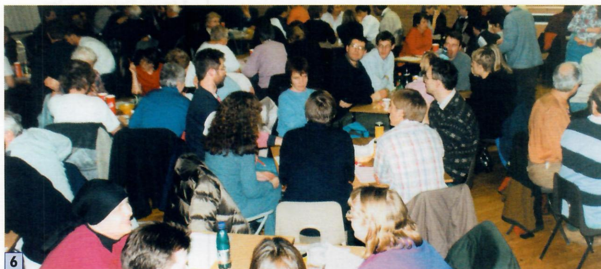
28/01/2000 10:30 HMS