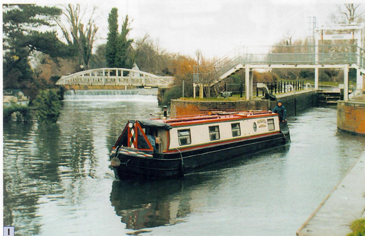
30/01/2000 11:00 ARH