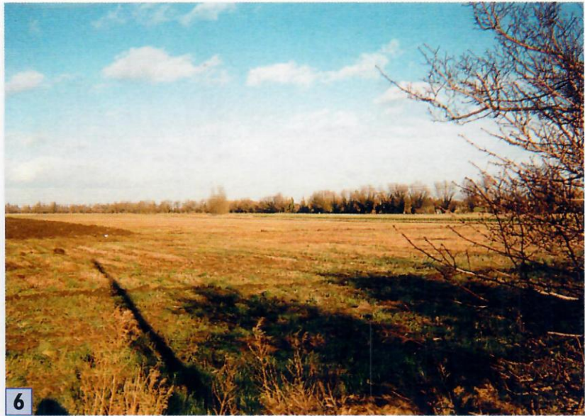
6 10/02/2000 AGS