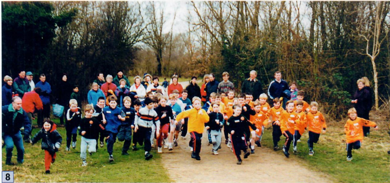
8 12/02/2000 AGS