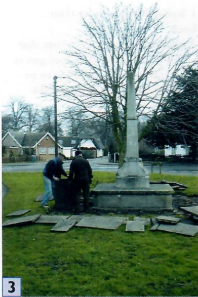
3 07/02/2000 PO