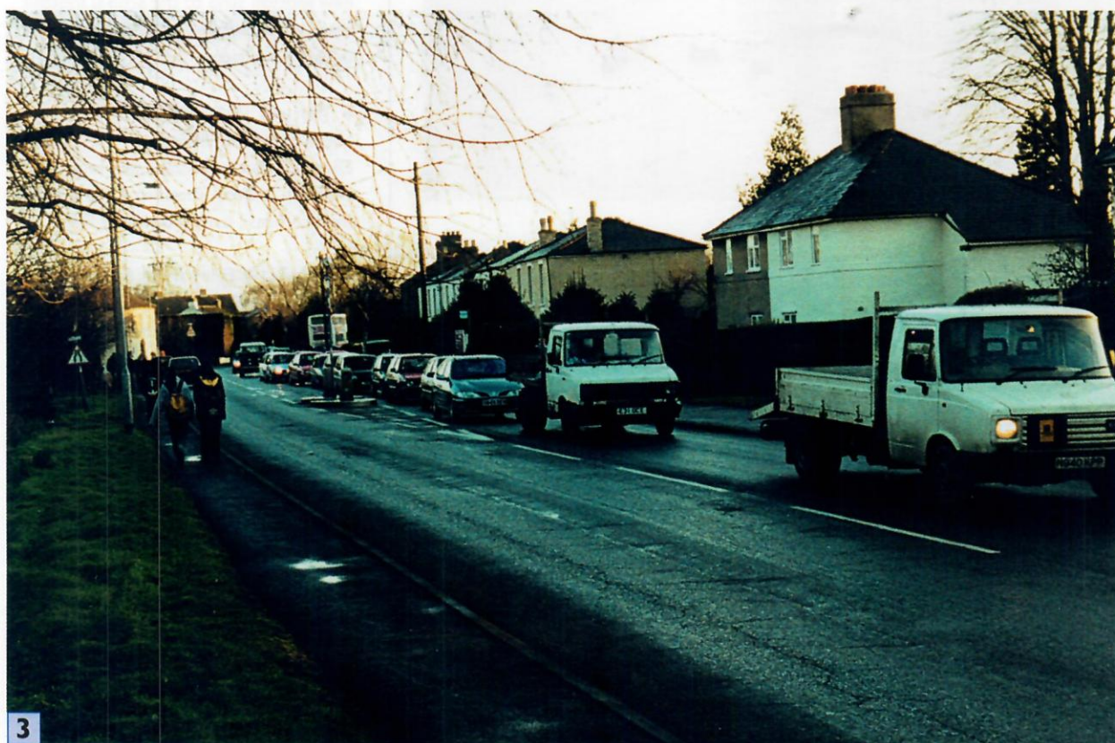
15/02/2000 08:00 SMB