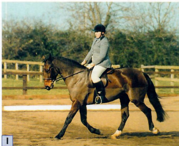
1 06/02/2000 HMS