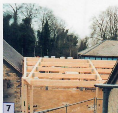
20/02/2000 15:00 MJS