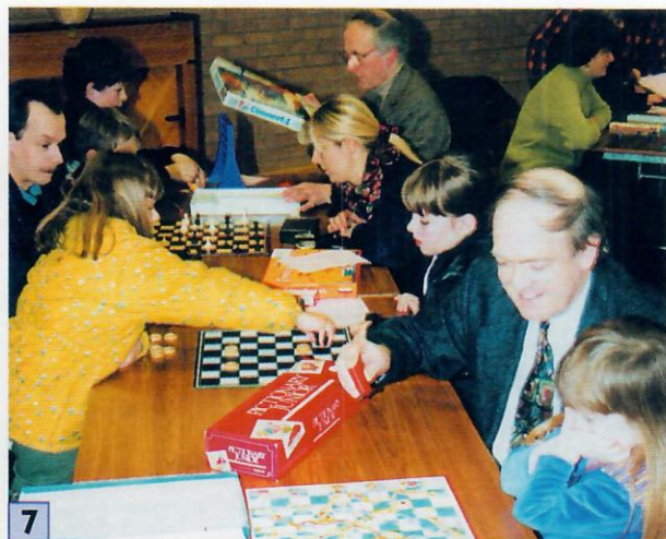
7 11/02/2000 18:30 JS