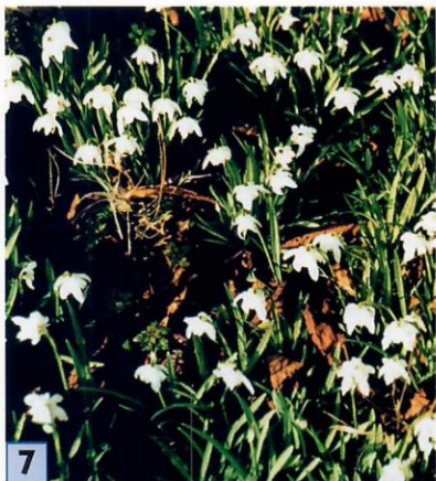
19/02/2000 10:30 ARH