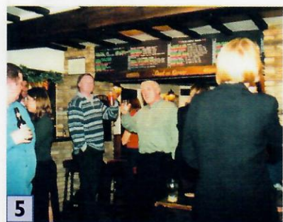
31/12/2000 23:52 JEC