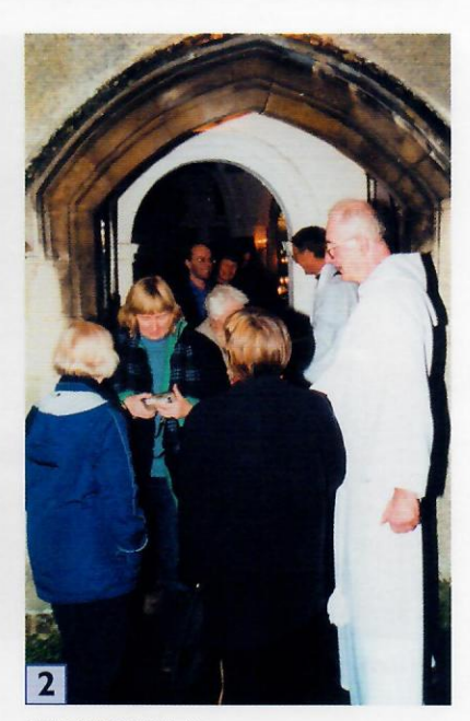
25/12/2000 00:40 JD