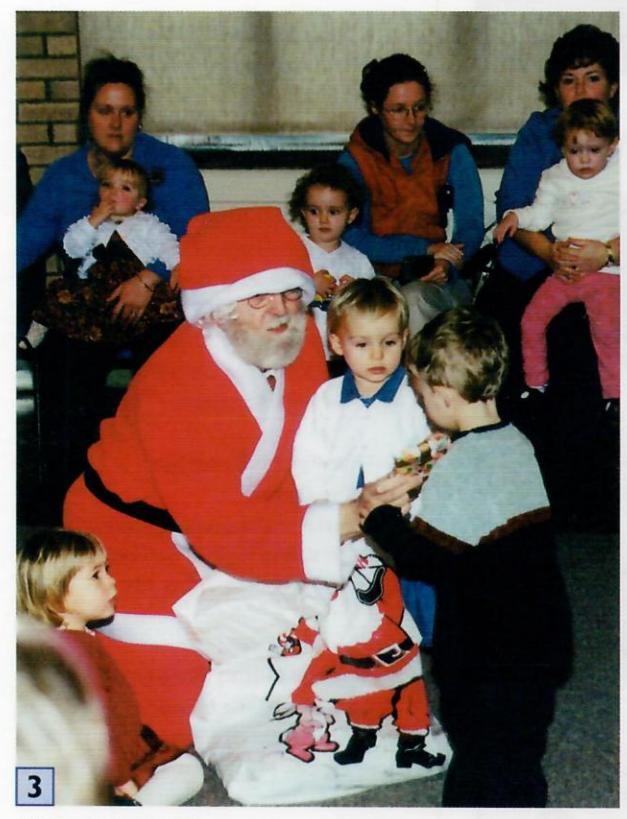
11/12/2000 11:00 HMS