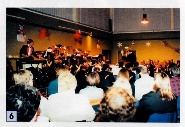
20/12/2000 20:45 JEC