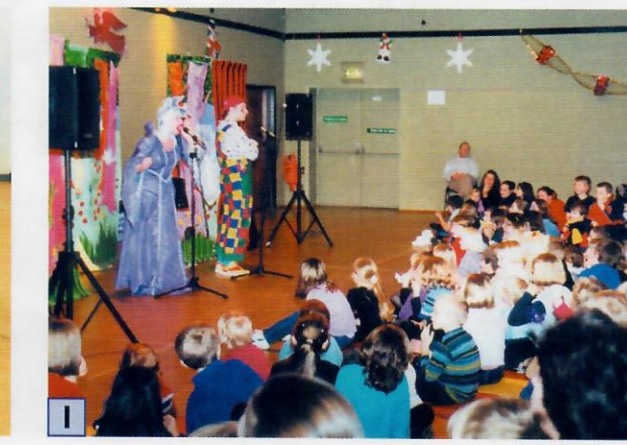
10/12/2000 18:00 HMS