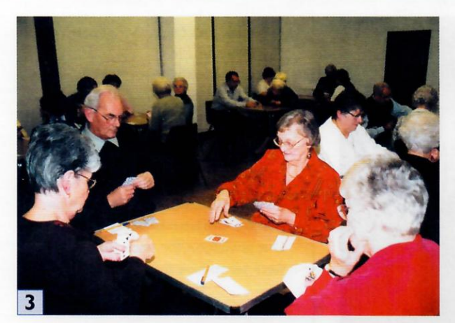
19/12/2000 21:30 JD