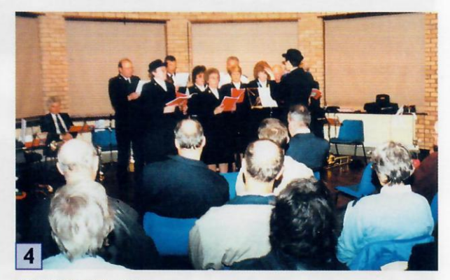
12/12/2000 20:00 HMS