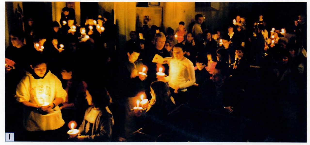
03/12/2000 16:00 ARH