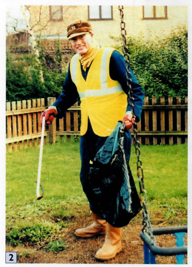
18/12/2000 14:00 HMS