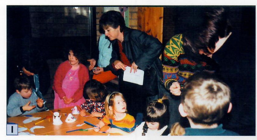
24/12/2000 15:00 JS