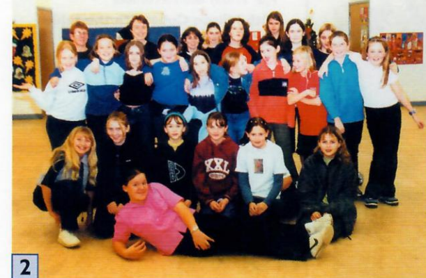
11/12/2000 19:30 HMS