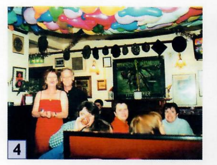
31/12/2000 23:50 JEC