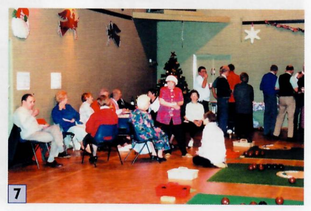
21/12/2000 21:00 MJS