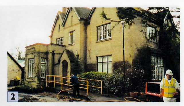
04/12/2000 11:00 HMS