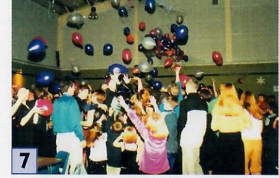
31/12/2000 24:00 JEC

A picture taken every day, and much relief all round!