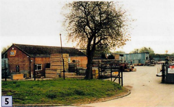
12/04/2000 13:00 SMB