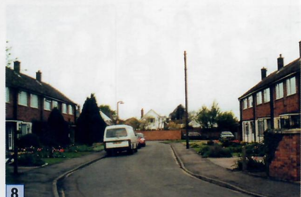
20/04/2000 16:30 JEC