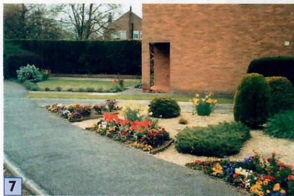
19/04/2000 14:00 MJS