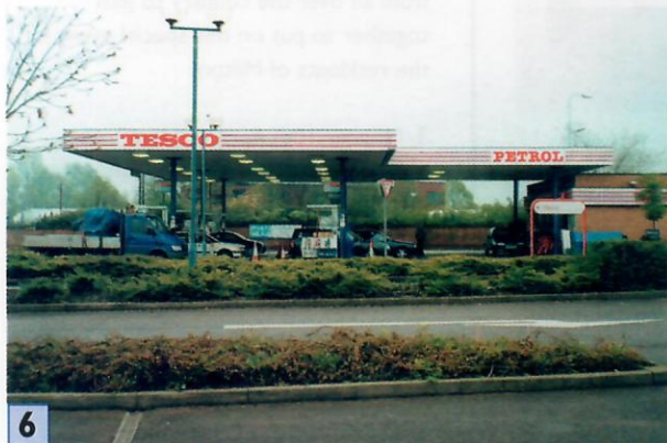
18/04/2000 10:00 MJS