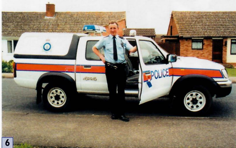
6 27/04/2000 18:00 JEC