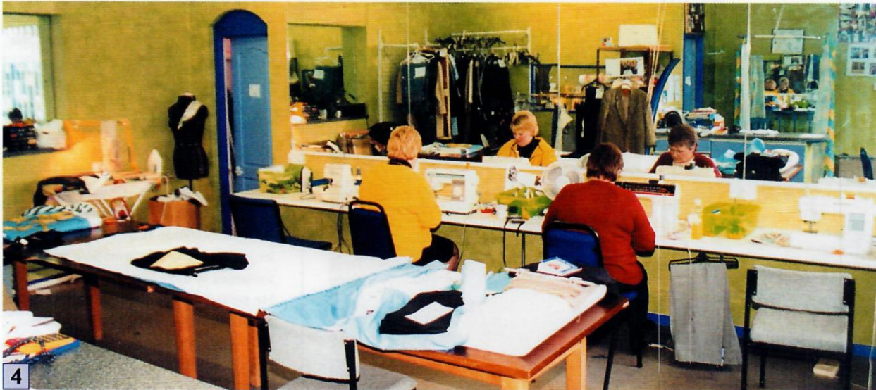
11/04/2000 13:30 SMB