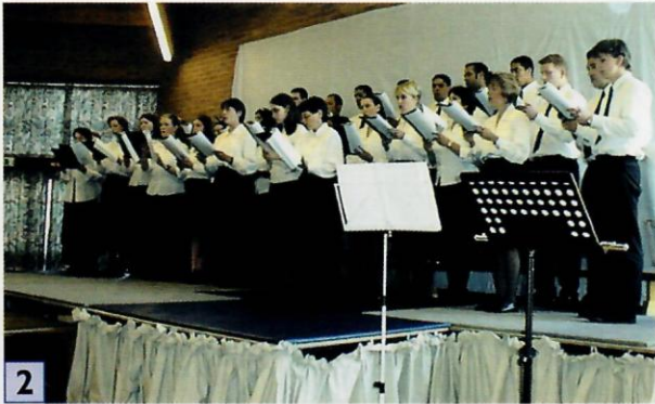
09/04/2000 15:30 JEC