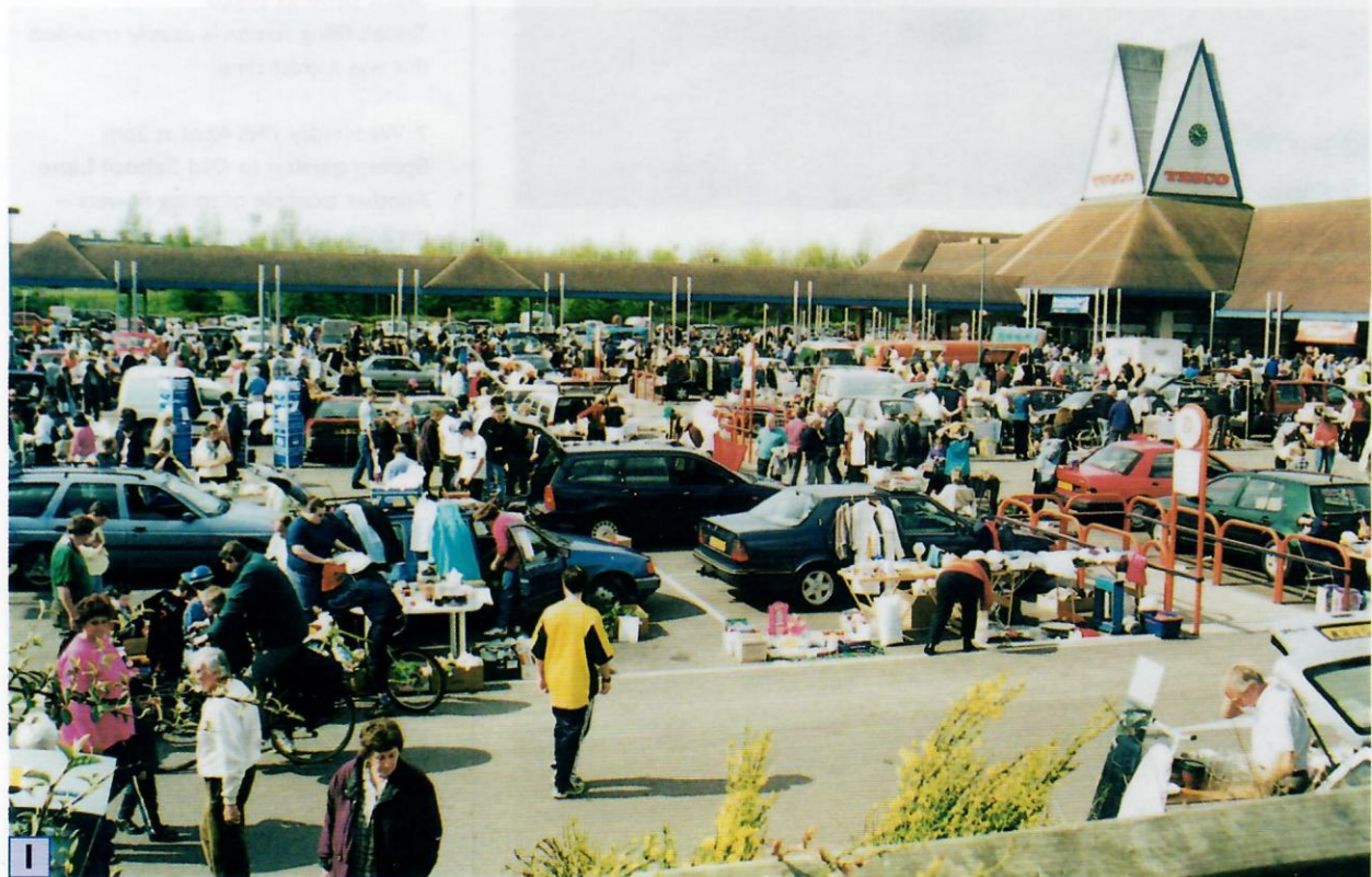
25/04/2000 15:00 JD