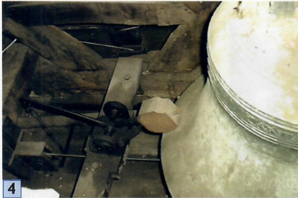
16/04/2000 15:00 SMB