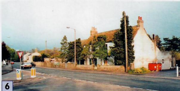
13/04/2000 13:30 SMB