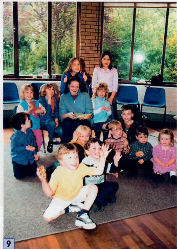
21/04/2000 16:30 JEC