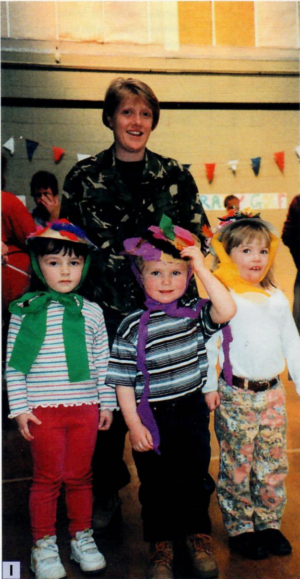
09/04/2000 15:30 HMS