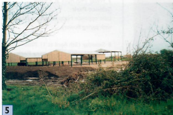
17/04/2000 10:00 MJS