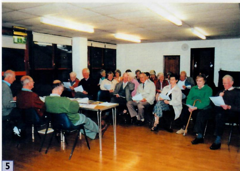
5 27/04/2000 19:30 JEC