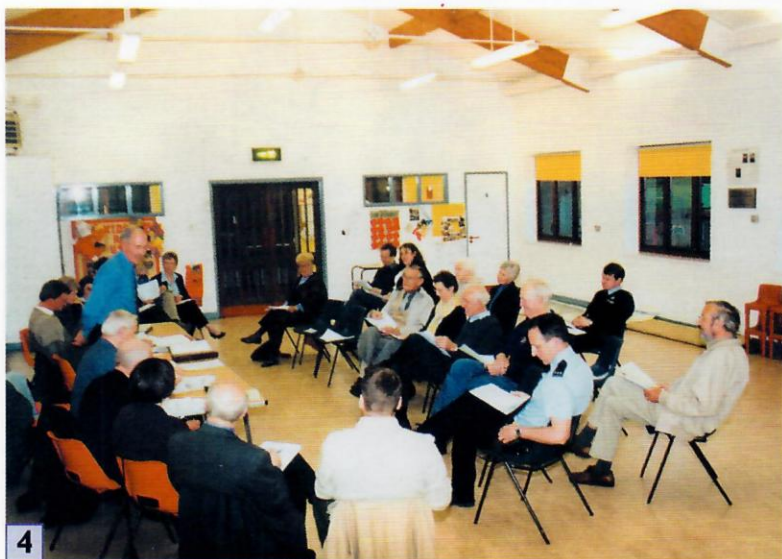
4 26/04/2000 19:30 JLC