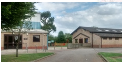
Milton Community Centre and Annexe