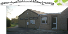
Parish Council Office

Jane Coston cycle & footbridge to Cambridge