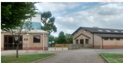
Milton Community Centre and Annexe