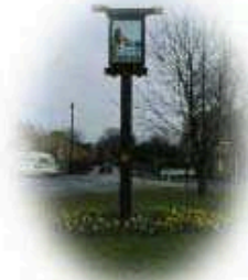
Village sign and daffodil planting around the village