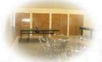
Provided the new youth building