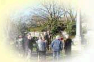
Organise the Remembrance Day ceremony and recently arranged for the memorial to be restored