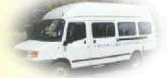
We own a community minibus which is used by several organisations in the village