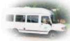
Milton Trolley Bus Tesco shopping trips for the elderly who need this help