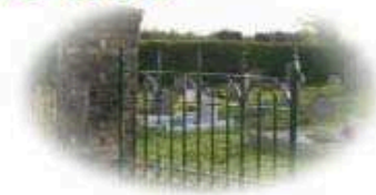
Manage and maintain the cemetery