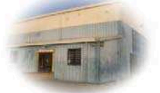
Support financially Milton Community Centre complex