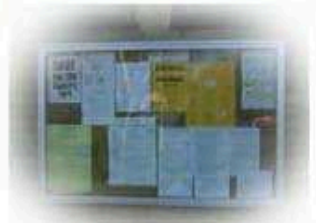
Parish Notice boards and web site - www.miltonvillage.org.uk