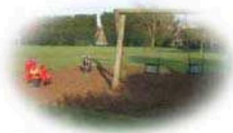
Maintain and replace play areas and play equipment