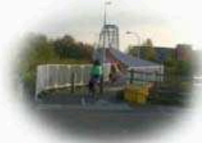
Double yellow lines have been budgeted for for the bottom of the bridge