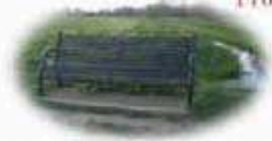
Install and maintain seats