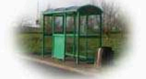
Provide and maintain bus shelters, litter bins and dog bins