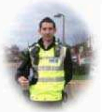
Keep in touch with our local police on village matters