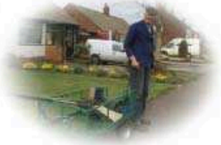
Organise litter picking and street cleaning