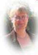
We employ a mobile warden who helps our elderly maintain their independence