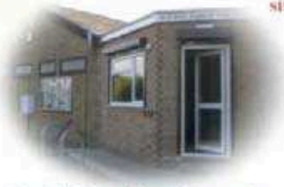
Parish Council meetings and office administration

We take the lead in getting things done in the village such as sheltered housing or new sports facilities. We comment on planning applications and generally act on behalf of the village in many other ways.