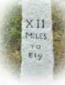
The mile stones were cleaned and painted by volunteers from the Milestone Society