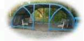
Shelter for the youth