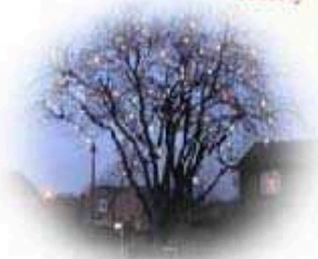
We organise the Christmas lights